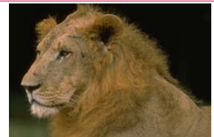
I’m a Lioness

One day I want to be the queen of the jungle.